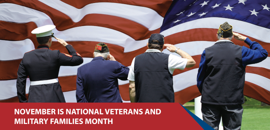
NOVEMBER IS NATIONAL VETERANS AND MILITARY FAMILIES MONTH