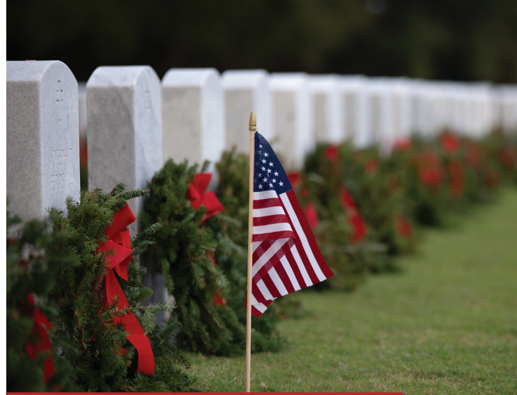
WREATHS ACROSS AMERICA - DECEMBER 16TH

From December 11th to 20th, bust out your holiday decorations! We will be picking one winner from each neighborhood. Winners will receive a $25 gift card! Winners will be announced December 21st.