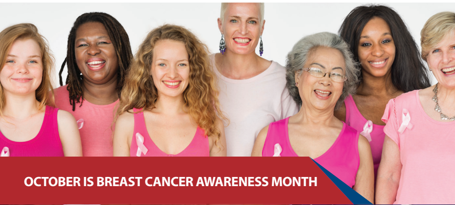
OCTOBER IS BREAST CANCER AWARENESS MONTH